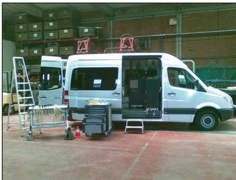
Fig. 1. Inspection van with lift and test equipment (Flanders).

Due to the increasing number of sprayers fitted with a rate controller ILVO felt the need to develop a new time saving and accurate inspection method for spray rate controllers.