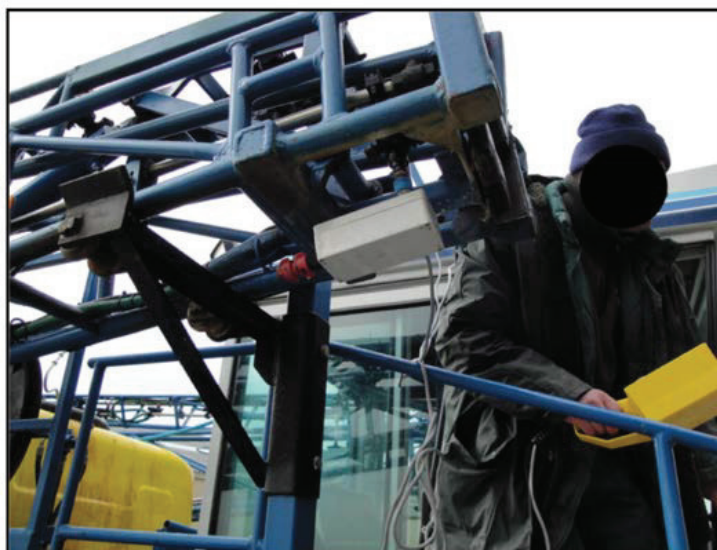
Fig. 5. Testing in practice.

As one can see the complete inspection procedure has been shortened and the new method has a lot of advantages. The driver can completely concentrate on driving and maintaining a constant speed. There is also no need to stop and restart at the first marking point resulting in a more accurate measurement and saved time. Also important to mention is that while performing the test the real time flow rate can be read out so while driving the inspector can already determine if the spray rate controller works correct. Furthermore after testing, the volume can be read out directly with a known accuracy.