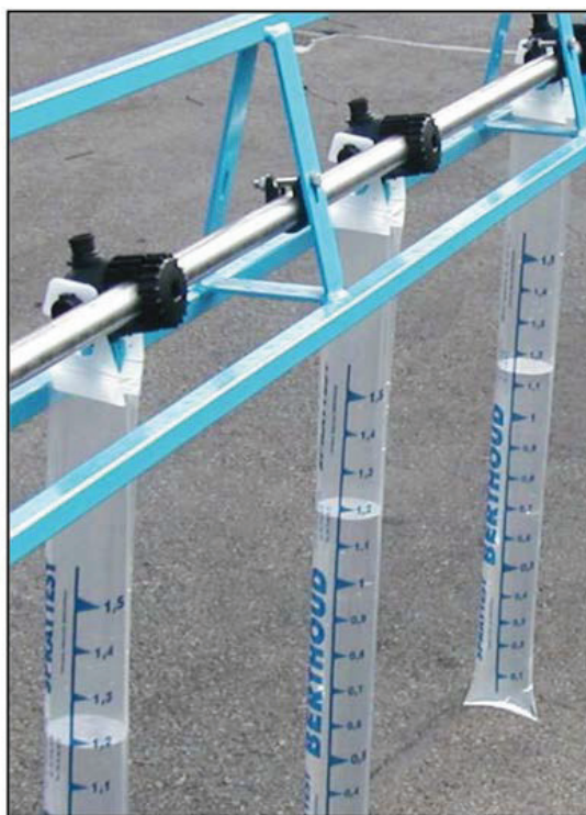
Fig. 2. Spraytest bags.

Two marking points were placed with a distance of 100 m in between with at least 10 to 20 m of free “run in” track before the start of the 100 m track. Farmers/fruit-growers were asked to program their usual application rate and to start a first short run (e.g. about 20 m) at a constant speed. During this run, the rate controller could adjust the control valve to obtain the desired application rate. After this run in, the farmer was asked to stop spraying by shutting of the main valve and the inspector placed 3 spray test sacs underneath three nozzles (Fig. 2).